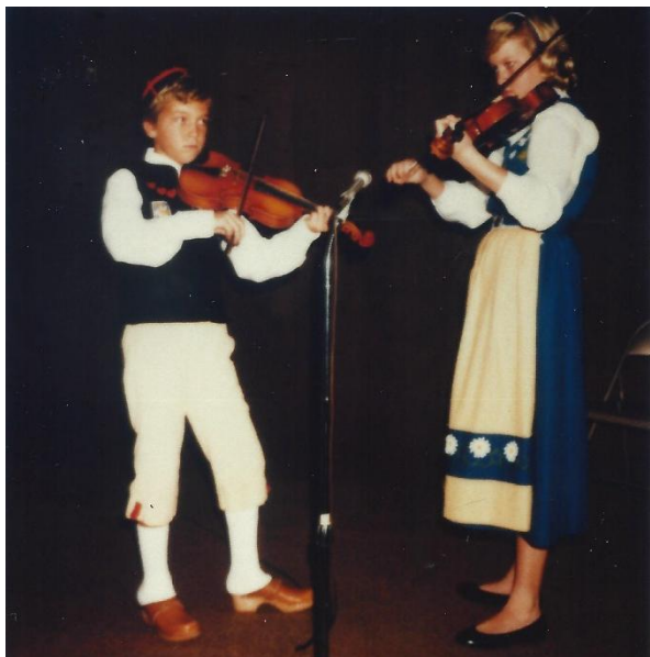
1985-12 Children's Club performing at St. Lucia celebration

Did you know _____ about Monitor Lodge? This occasional section features factoids about Monitor Lodge and VASA. This month we have a small selection of events from the late 1980s: