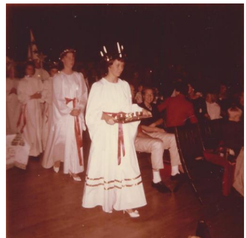
1967 - St. Lucia and tärnor (attendants)