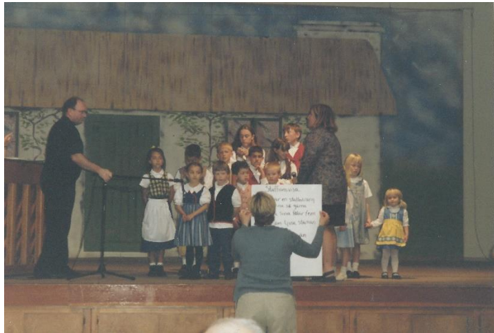
2000ish at St. Ignatius auditorium