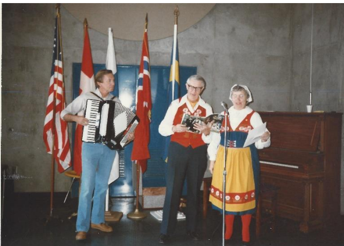
1986 at Board of Realtors Auditorium

Did you know _____ about Monitor Lodge? This occasional section features factoids about Monitor Lodge and VASA. This month we are taking a very short walk down memory lane featuring Monitor Lodge members participating in past Scandinavian Festival events.