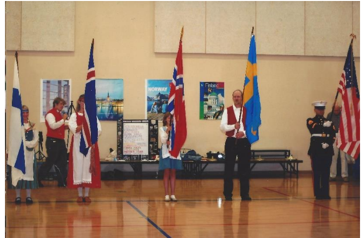
2010 at Divine Saviour - flag bearers

How good is your Swedish vocabulary? If you want to brush up on your Swedish in addition to Monitor's Swedish language classes led by Will Hanley you will find Swedish vocabulary and lessons in the Swedish edition of The Local ( https://www.thelocal.se/ ) or Nordstjernen ( http://www.nordstjernen.com/ ). You can also get a language fix from bi-weekly podcasts at: https://shows.acast.com/the-newbie-guide-to-sweden-podcast .