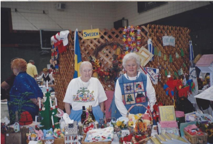
2000ish at St. Ignatius auditorium