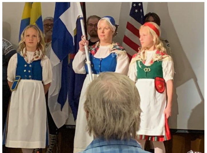
Parading the Finnish flag