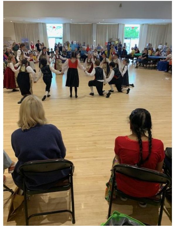
The Children's dance troupe (IDAC)