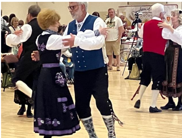
Sacramento Area Nordic Dancers