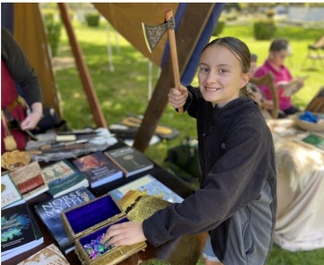
Enjoying practicing Viking skills