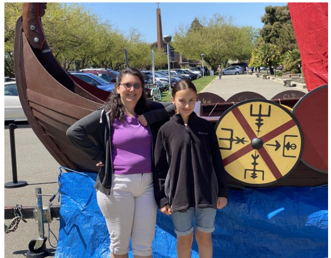
Disappointed we can't sail the Viking ship down the American River