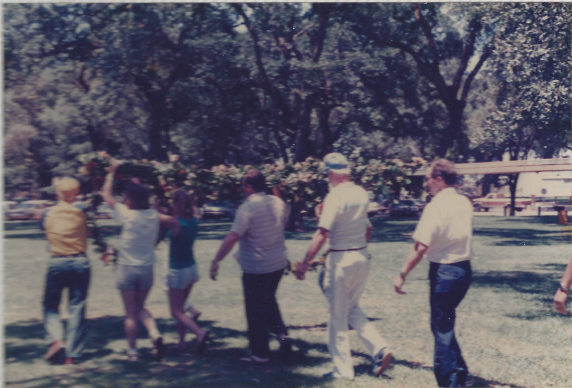
The Maypole is promenaded.