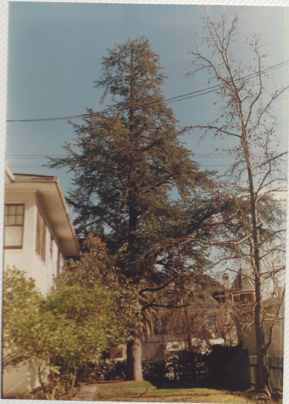
A tree still lives in Sacramento. This is the Cedar of Lebanon planted by Prince Wilhelm. You can see it at 25th and N.