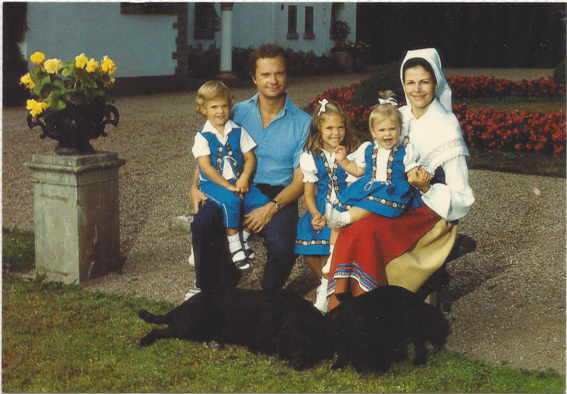
Sweden's first family. King Carl Gustav and Queen Sylvia with their three children. One of these will be the future monarch of Sweden, Do not be surprised if it is a Queen.