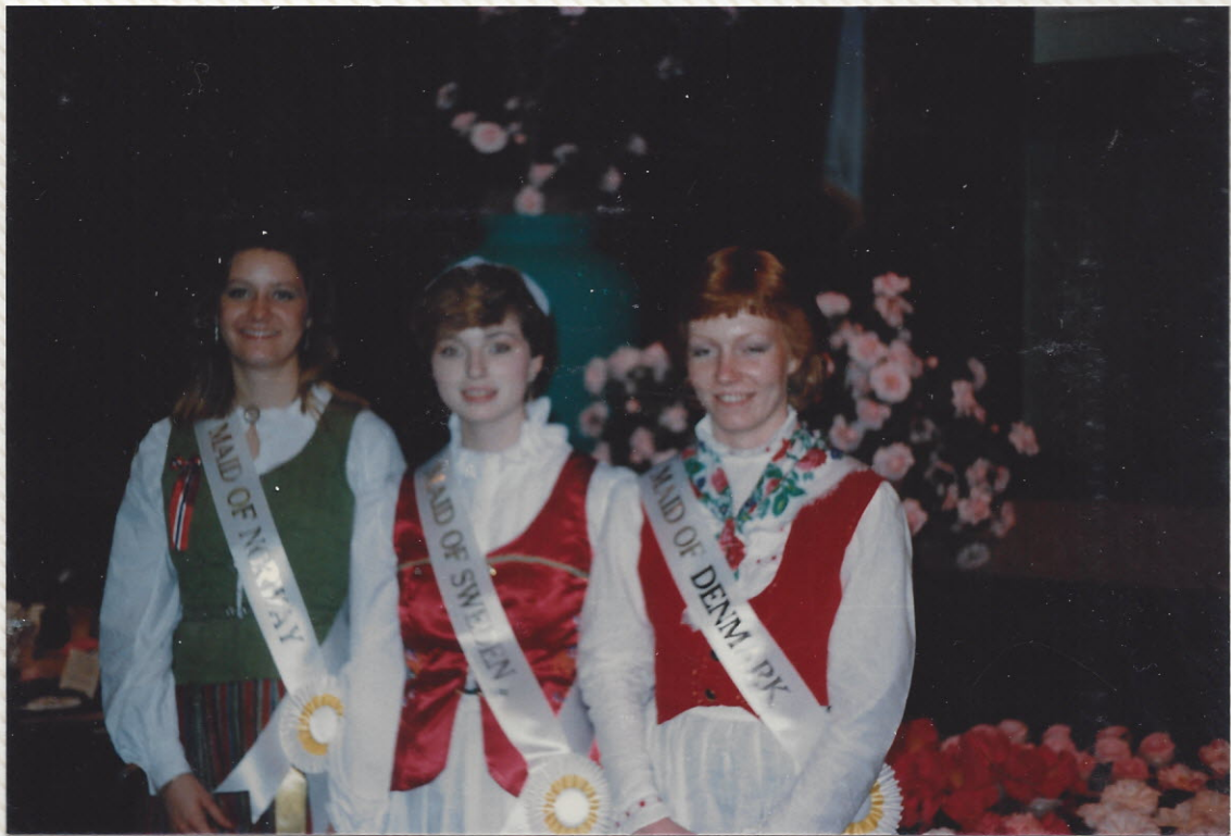
The maids of Scandinavia.