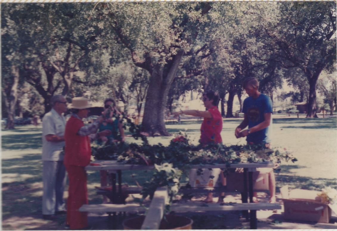
The 1985 Midsummer begins with decorating the Maypole.