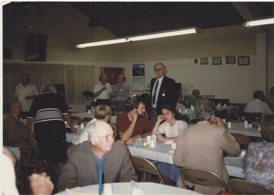
The crowd grows restless waiting for their table to be called.