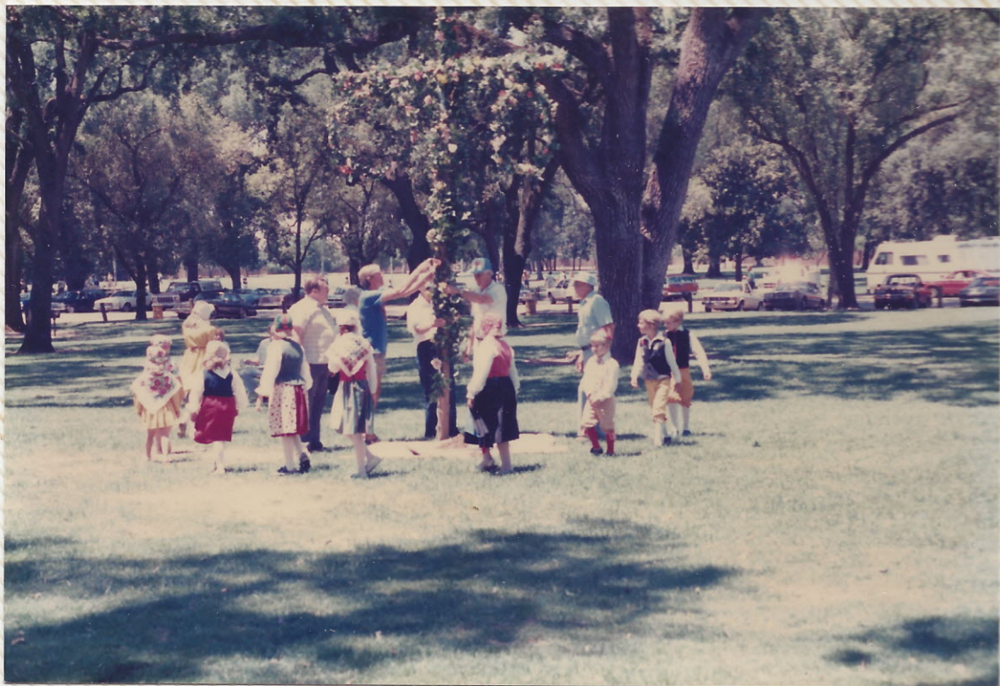
The Maypole is erected. The children in Swedish costume are from the children's clubs of Nord Lodge and Monitor Lodge.