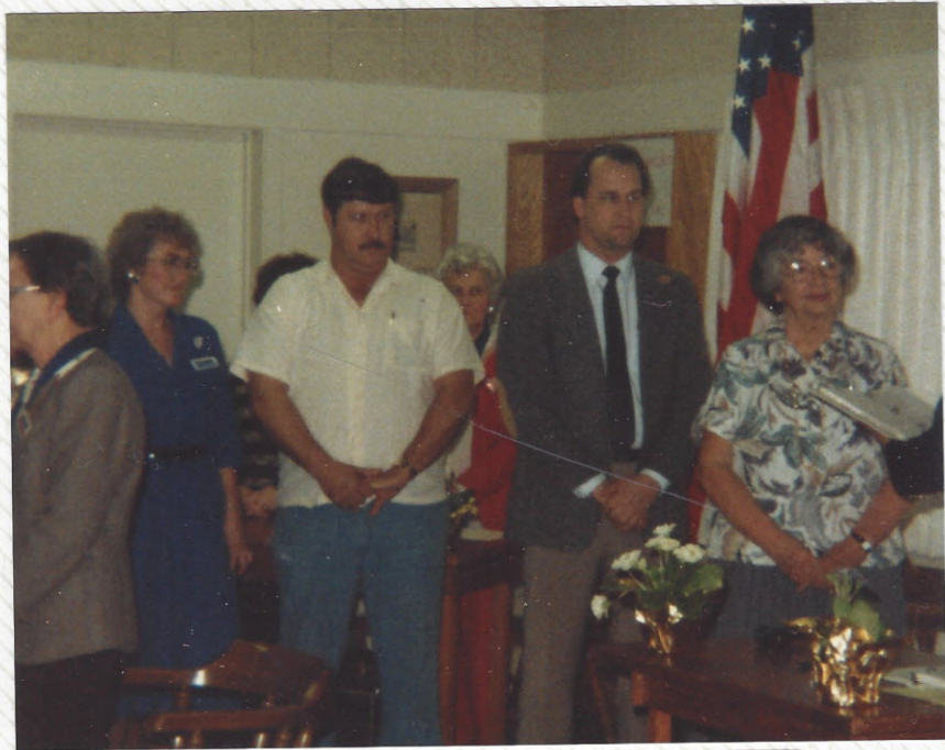
Installation 1988 of officers