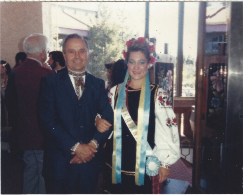
The Ukrainian girl was the main "princess" for the 1988 International Festival. Ukraine was the featured country that year