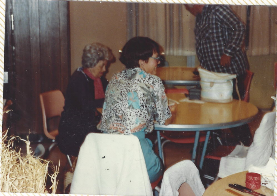
Mira Loma HS teachers' lounge - ???, VASA member from Sweden