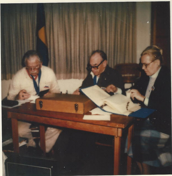
Monitor Lodge officers '97